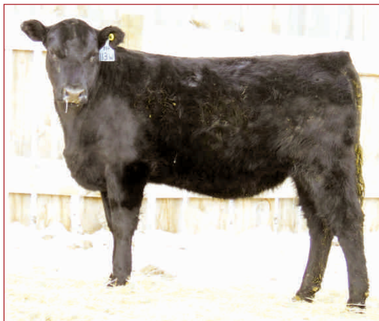
EASTONDALE ANNIE K 113'09 - LOT 113W

If these Tradition females carry any blood of their paternal granddam, the great HA Beletta 0219 cow, they will certainly not hurt any breeding program, new or old. FANCY FANCY heifer here!