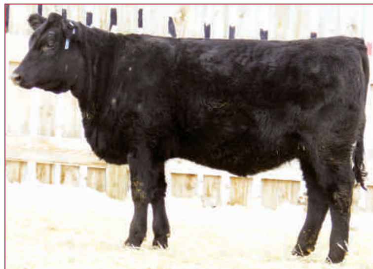
EASTONDALE BETSEY 51'09 - LOT 51W

A big strong female out of our Betsy cow line again. Lots of maternal stacked in this pedigree. Crescent Creek Main Event 6H, Masterplan 007, Bando 9074, and the BBAR Hero 1267 bull should work out well into the future.