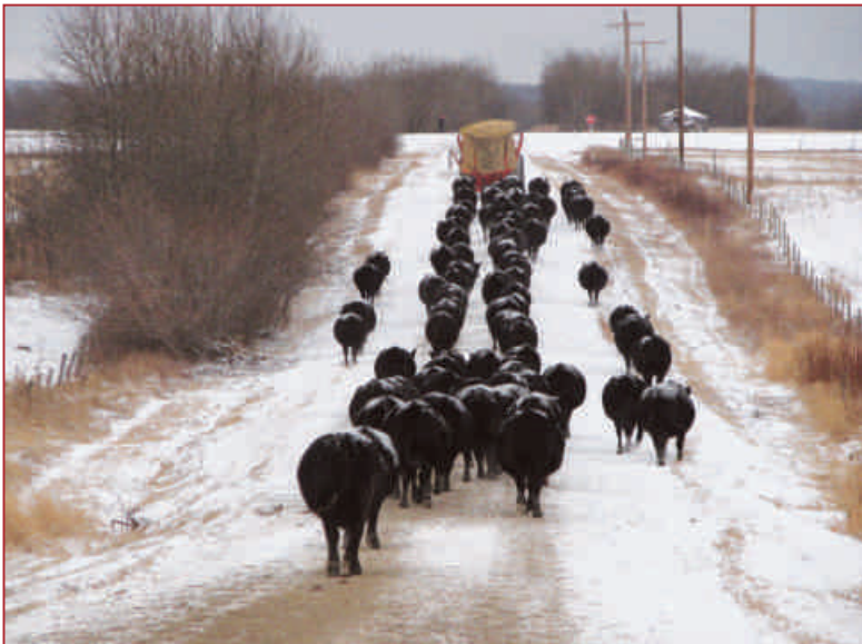
EASTONDALE COW HERD WINTER 2010