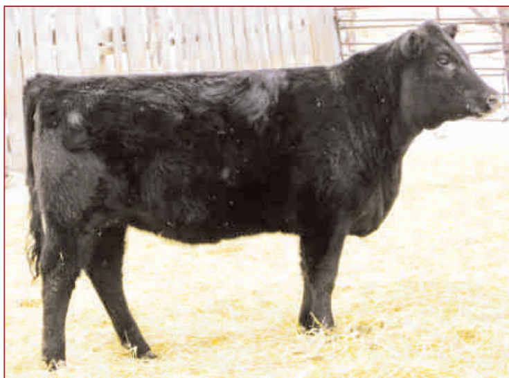
EASTONDALE DUCHESS 21'09 - LOT 21W