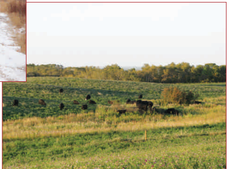
EASTONDALE COW HERD ON THE PASTURE