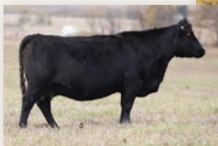
Dam of Lot 23