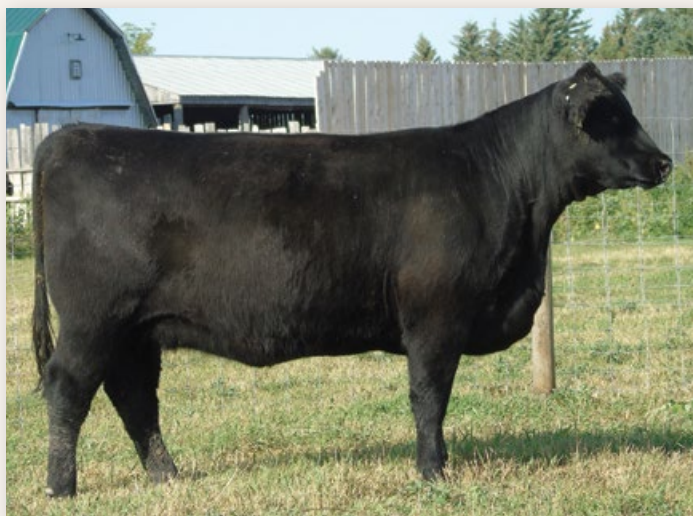
Full sister to Lot 26