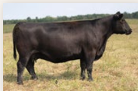
Dam of Lot 26