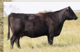
Dam of Lot 25