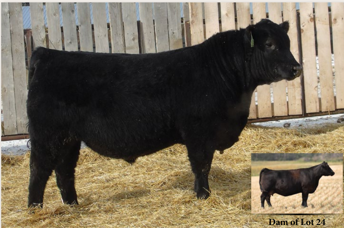
Dam of Lot 24