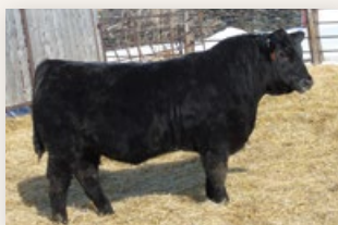
Maternal brother of Lot 12