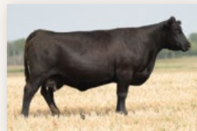
Dam of Lot 29