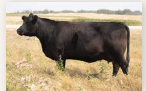
Dam of Lot 44

LLB REFLECTION 607A HF REFLECTION 241C HF TIBBIE 77Z