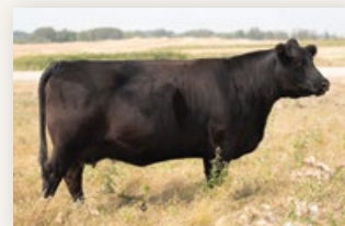
Granddam of Lot 7