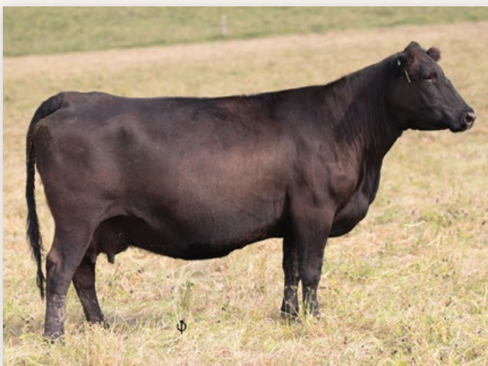
Dam of Lot 41