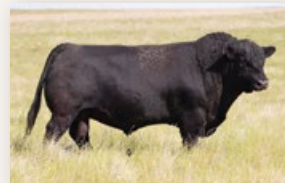
Maternal brother of Lot 30