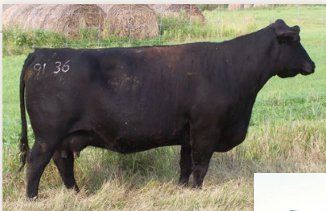
Granddam of Lots 1-5