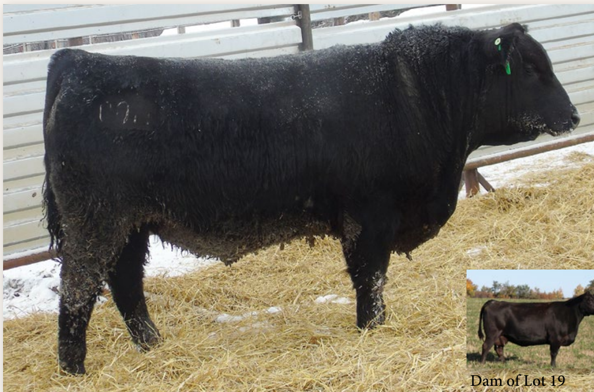
Dam of Lot 19