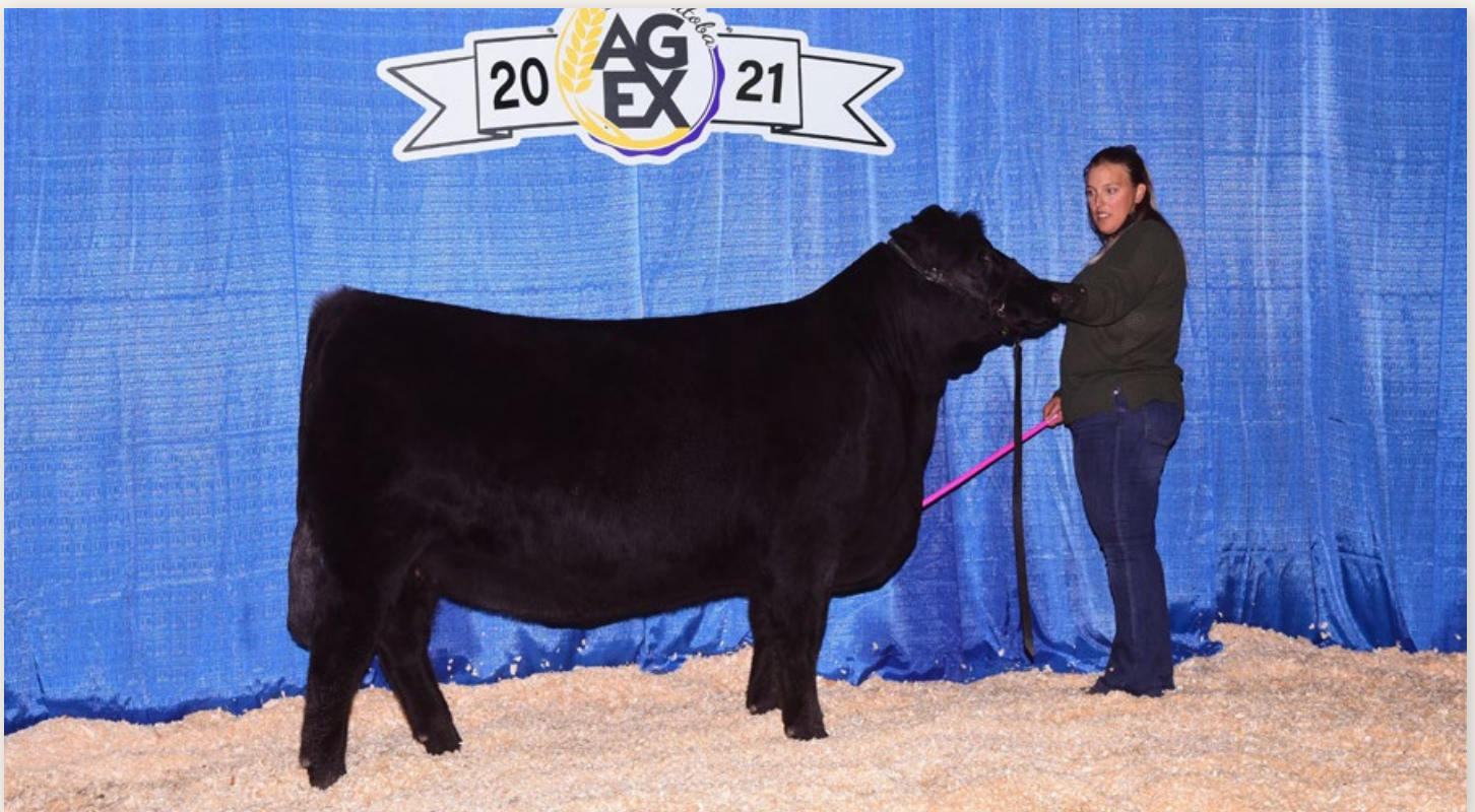
Eastondale Bonnie Lady 114'20 sired by Lorenz Endurance, Res. Intermediate Yearling Female at Agribition