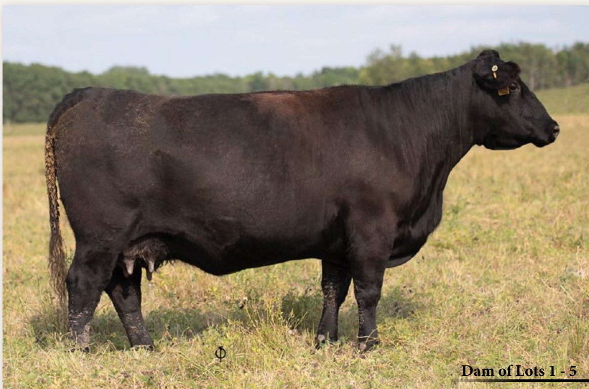
Dam of Lots 1 - 5