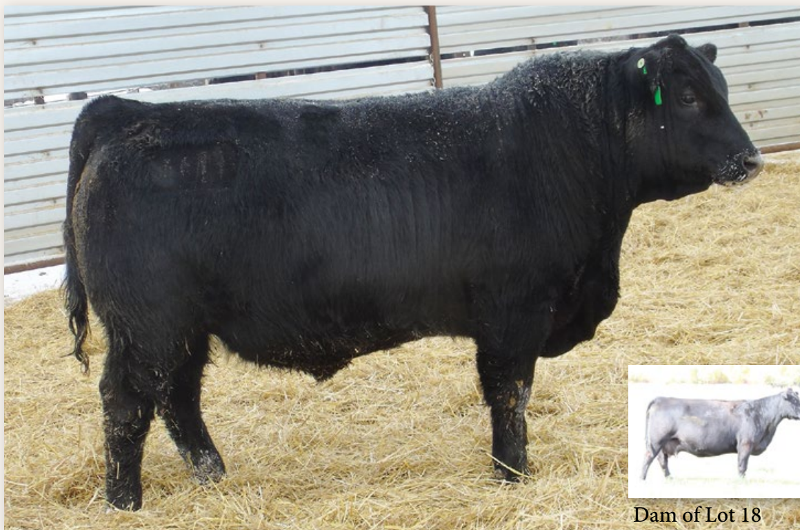
Dam of Lot 18