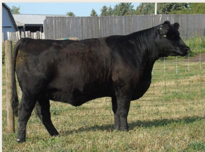
Dam of Lot 22