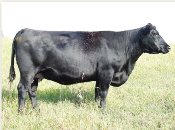
Dam of Lot 10