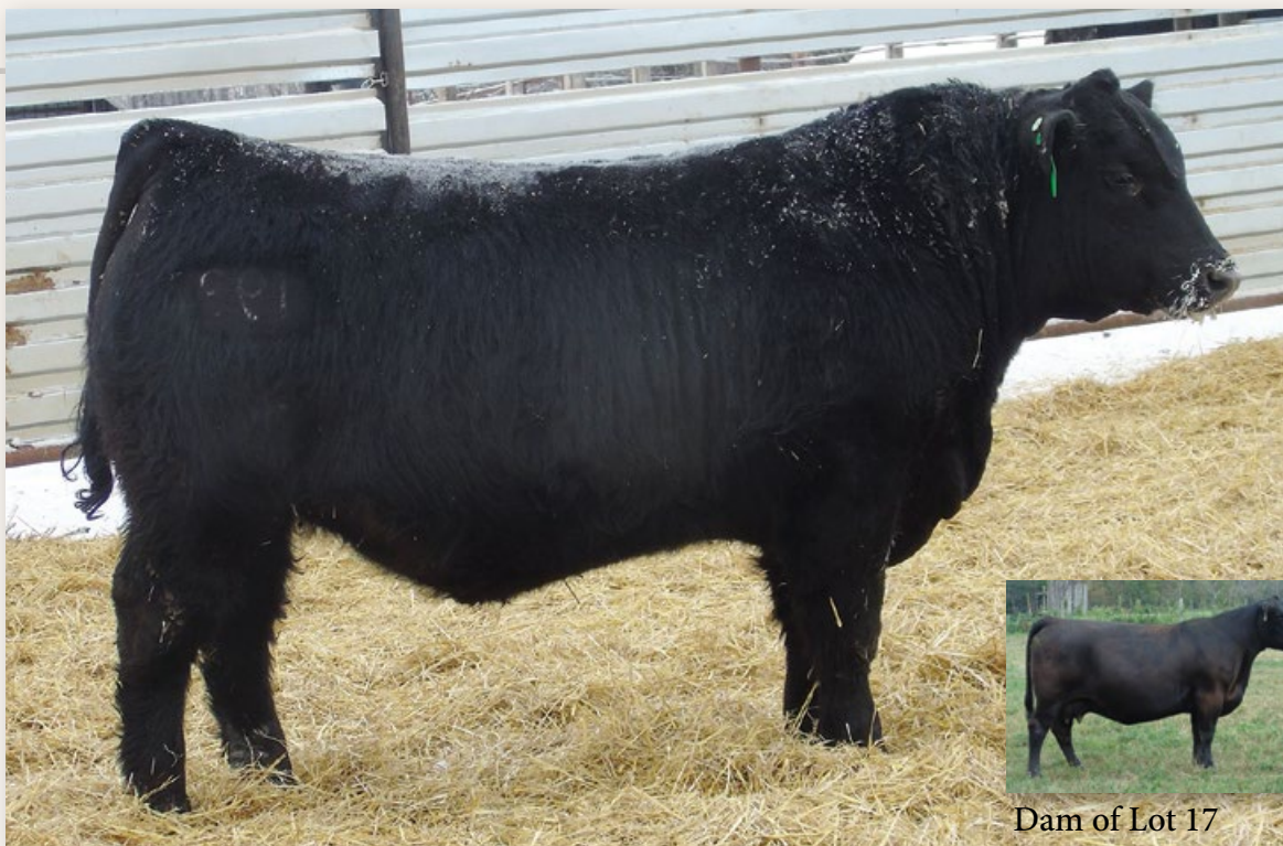
Dam of Lot 17