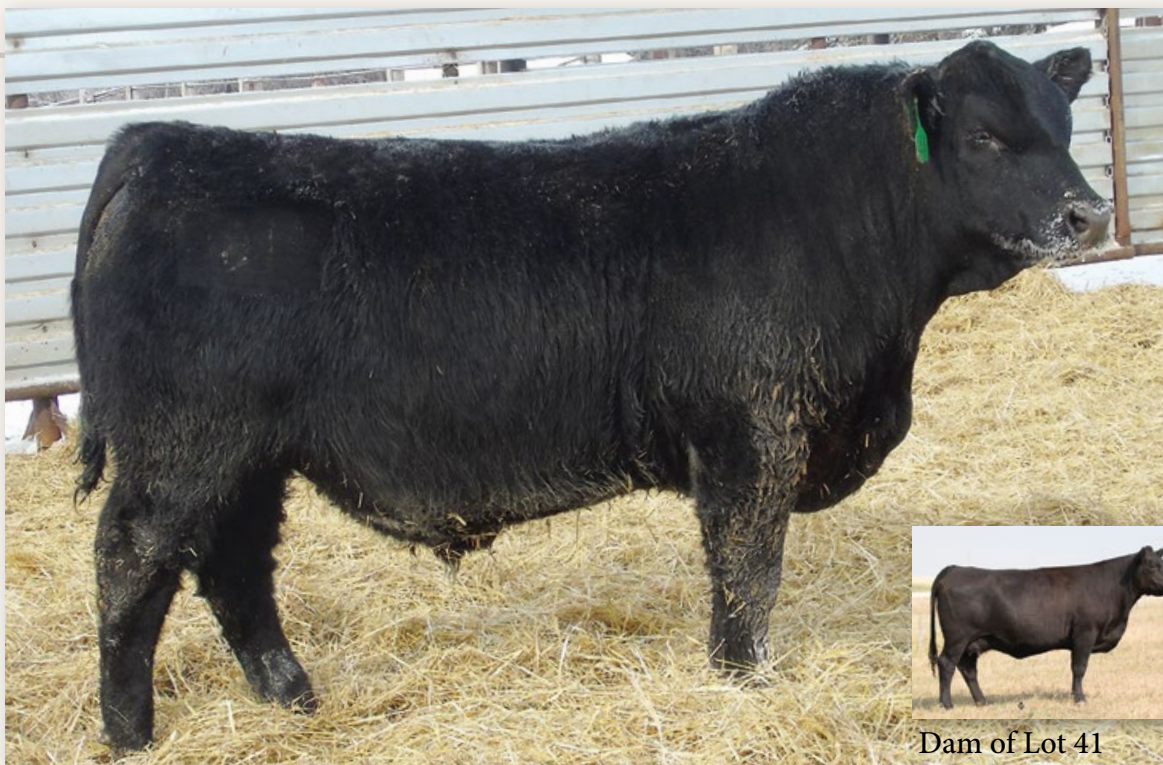
Dam of Lot 41