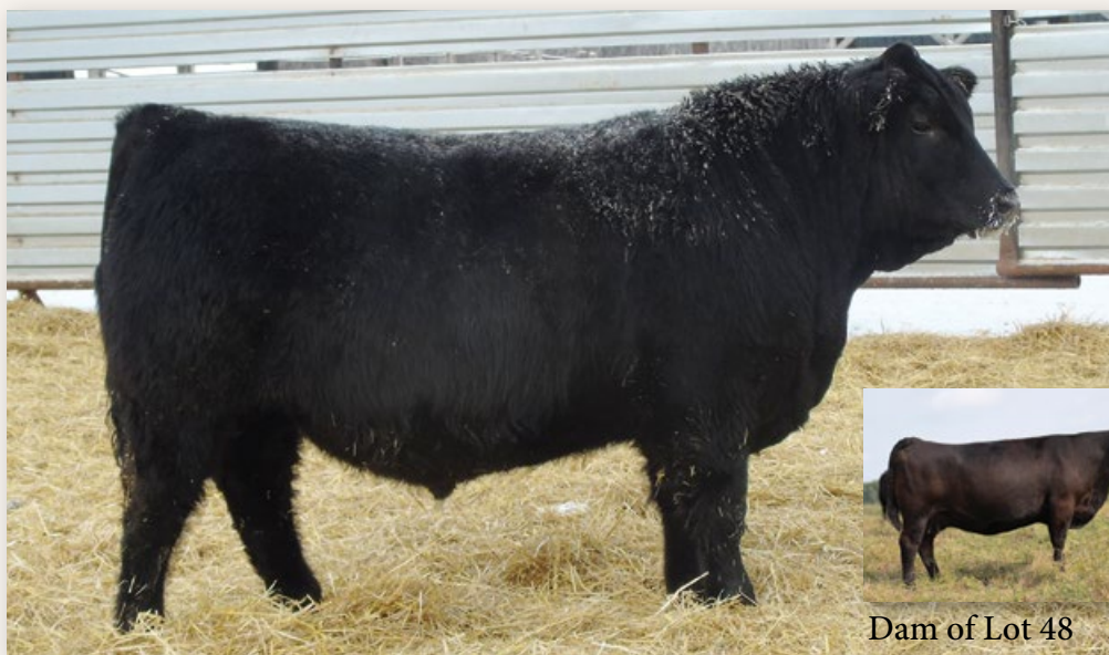
Dam of Lot 48