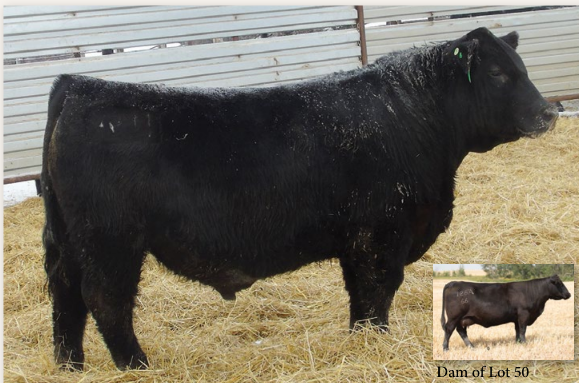
Dam of Lot 50