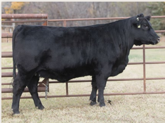
Maternal Sister to Lot 15