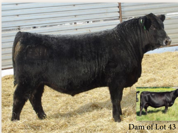
Dam of Lot 43