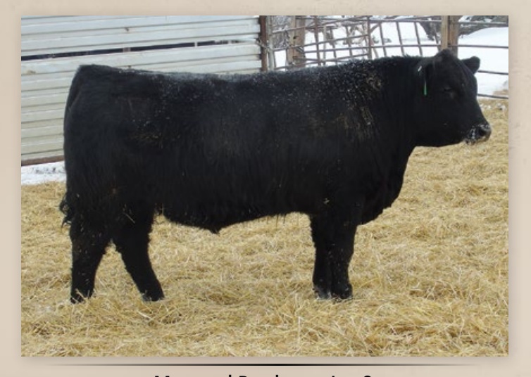
Maternal Brother to Lot 9

Act BW Adj 205 Adj 365 | EPD BW EPD WW EPD YW EPD Milk EPD CE 85 700 1229 | 1.4 48 88 17 2