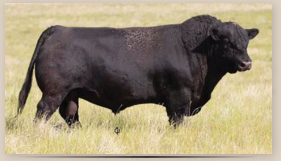
Sire of Lot 5