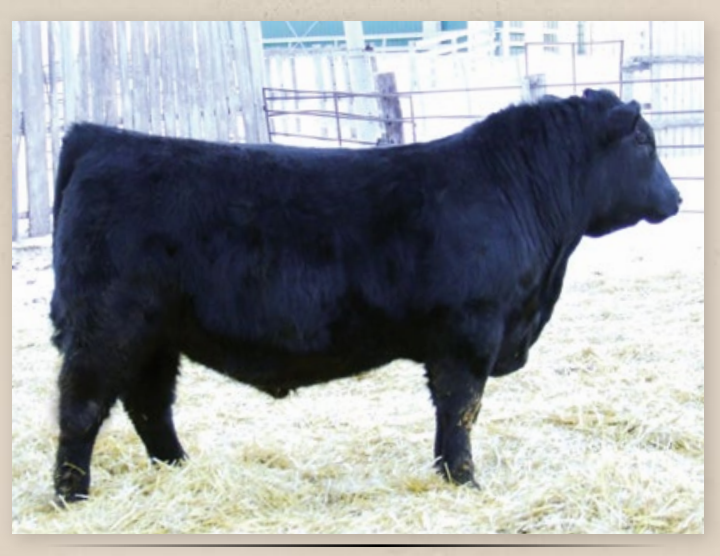
Maternal Grandsire to Lot 17

Great cow bull choice with a bigger weaning weight and a highquality dam