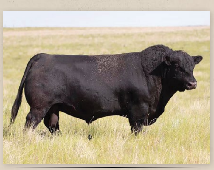
Maternal brother to the dam of Lot 38