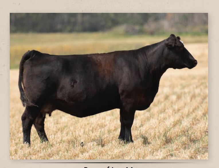
Dam of Lot 44