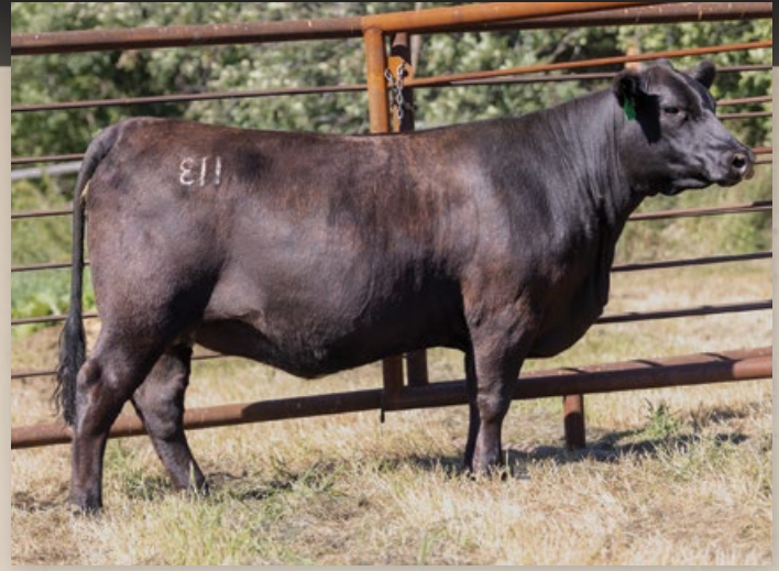
Maternal sister to the dam of Lot 39 High selling black bred heifer to Autumn Dew Angus