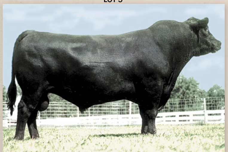
Sire of Lots 2 - 4