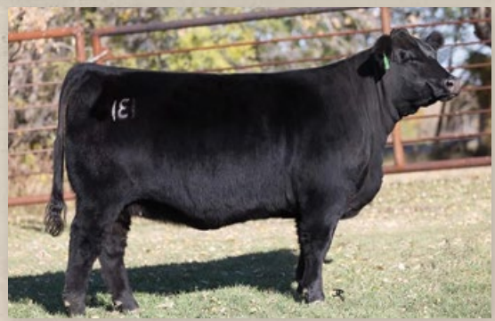
High selling bred heifer in Keystone sale to Brandy Lane Cattle Grand daughter of the Dam of Lot 5