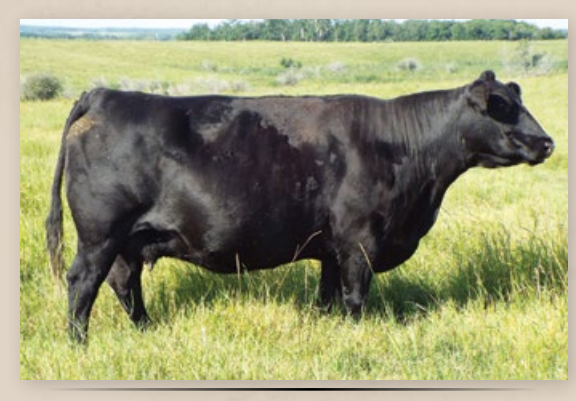
Granddam to Lots 1-4