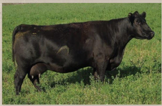
Dam of Lot 14