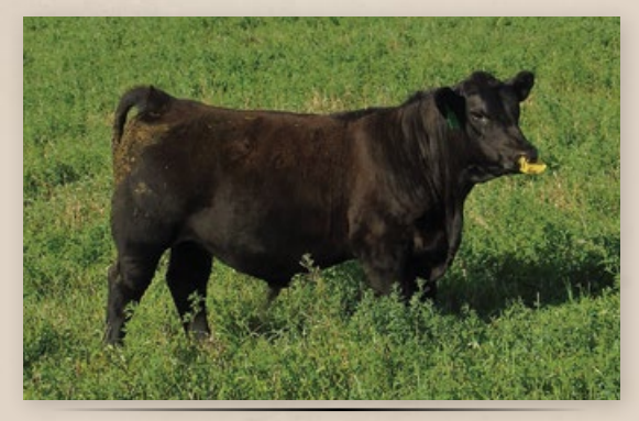
Lot 14 as a calf