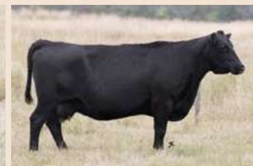
VK 29C, Dam to Lot 25