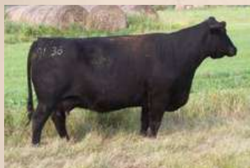
IMP 9136J, Granddam to Lot 19, 24