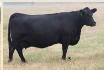
VKE 77A, Granddam to Lot 33