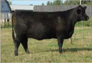
VK 34G, Dam to Lot 9