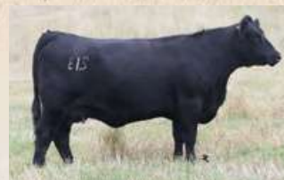
VKE 13K, Dam to Lot 4