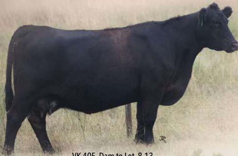
VK 40E, Dam to Lot 8,13