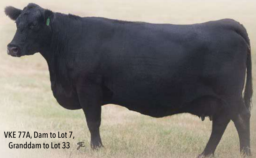
VKE 77A, Dam to Lot 7, Granddam to Lot 33