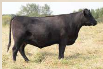
VK 159B, Granddam to Lot 31