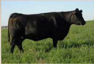
VKE 11G, Dam of Lot 16