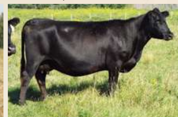
VK 131U, Granddam to Lot 25