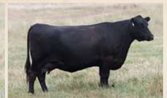
WTM 7D, Dam to Lot 6