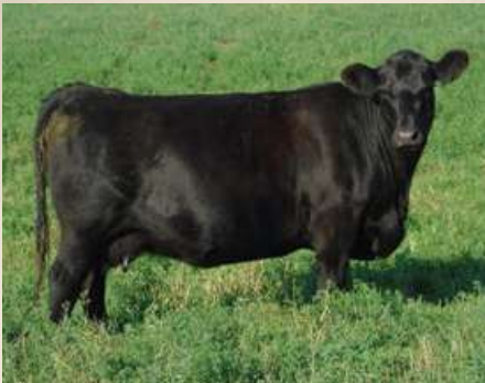
VK 20E, Dam to Lot 5