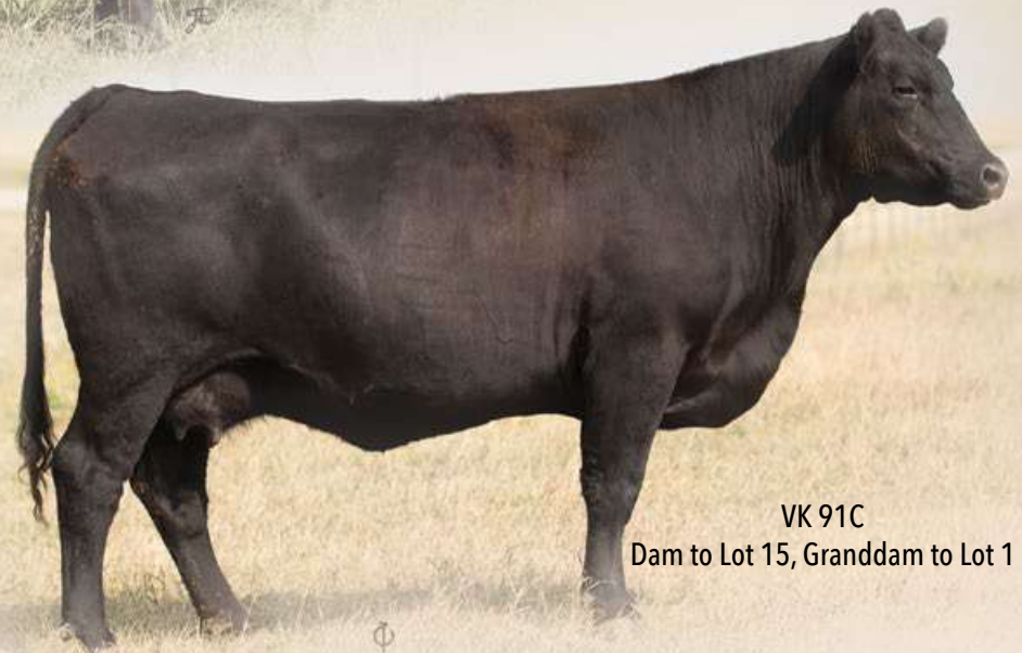
VK 91C Dam to Lot 15, Granddam to Lot 1