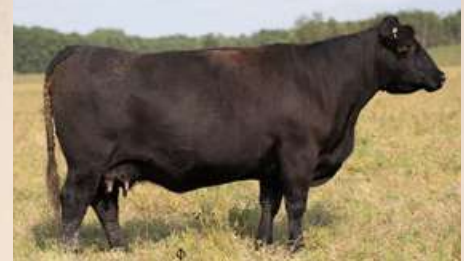
VK 91C, Dam to Lot 15, Granddam to Lot 1