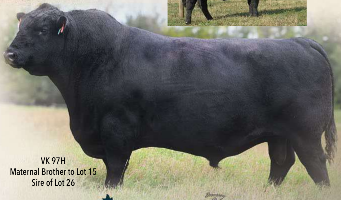
VK 97H Maternal Brother to Lot 15 Sire of Lot 26