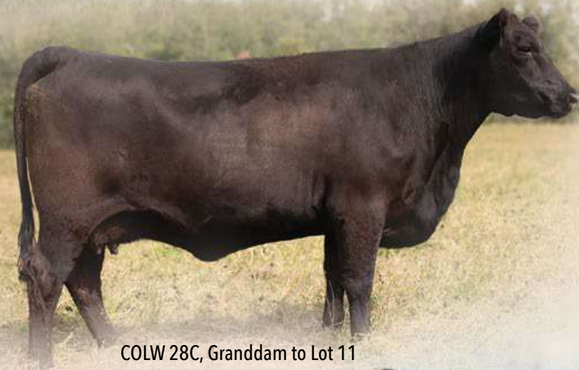
COLW 28C, Granddam to Lot 11