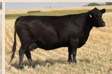
VK 8X, Granddam to Lot 25