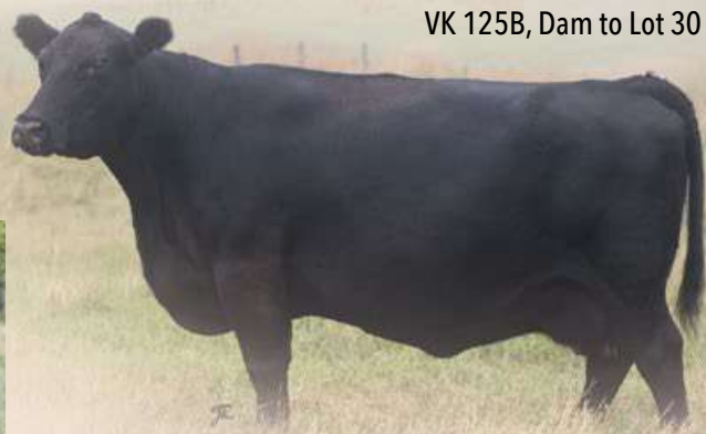
VK 125B, Dam to Lot 30