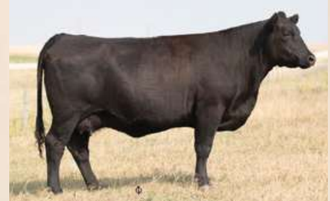
VK 77G, Dam to Lot 14