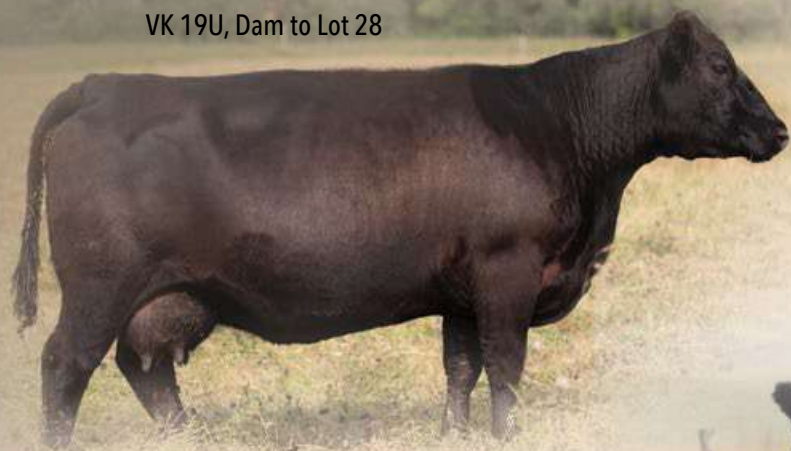
VK 19U, Dam to Lot 28