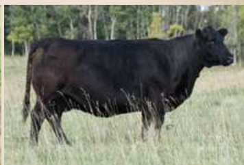
VK 62Y, Dam to Lot 20