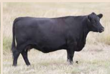
HRH 86H, Dam to Lot 18