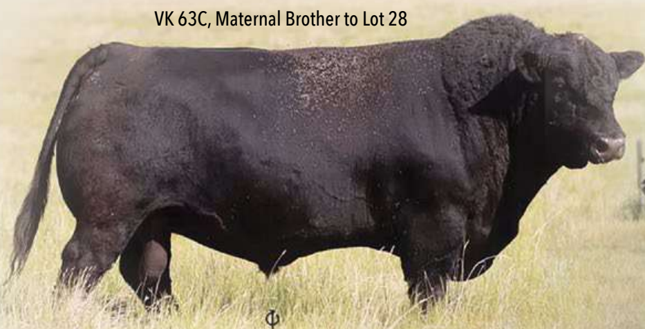
VK 63C, Maternal Brother to Lot 28