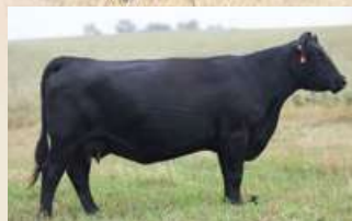
SFL 0114H, Granddam to Lot 4