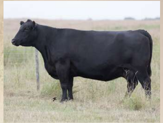
VK 108D, Dam to Lot 2