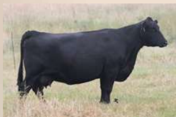
VKE 109C, Dam to Lot 21