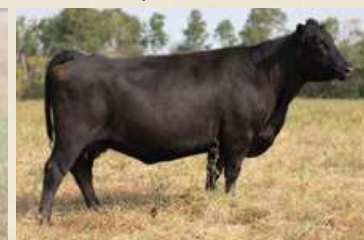
VK 5Y, Dam to Lot 34