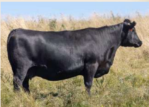
VKE 60D, Granddam to Lot 3